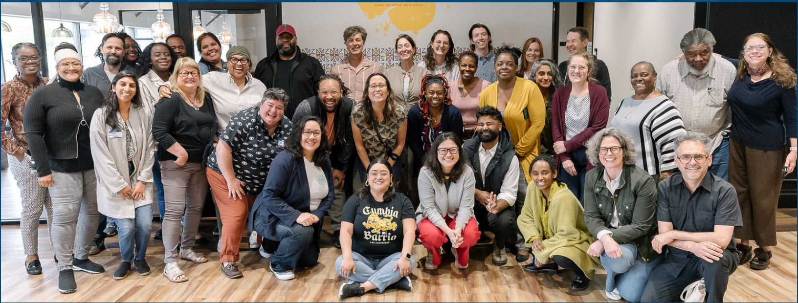
Above: MPA/SPA partners at the launch of the State Power Accelerator in Minnesota, May 2024